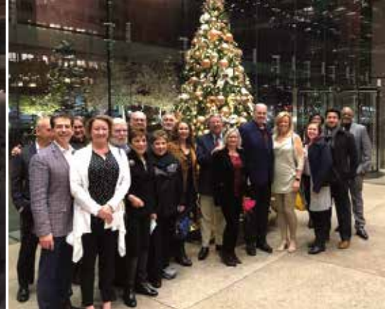
Club members on their way to see Preservation Hall Jazz Band at The Joseph Meyerhoff Symphony Hall