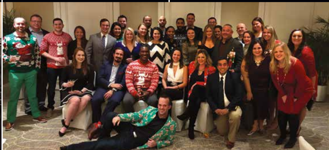
Young Members of the Club being jolly at the Young Members Holiday Party