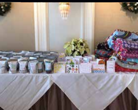
In Santa's workshop, members made 100 soup kits to feed 400 individuals, 50 cards for veterans, and 12 home made blankets for children in need.