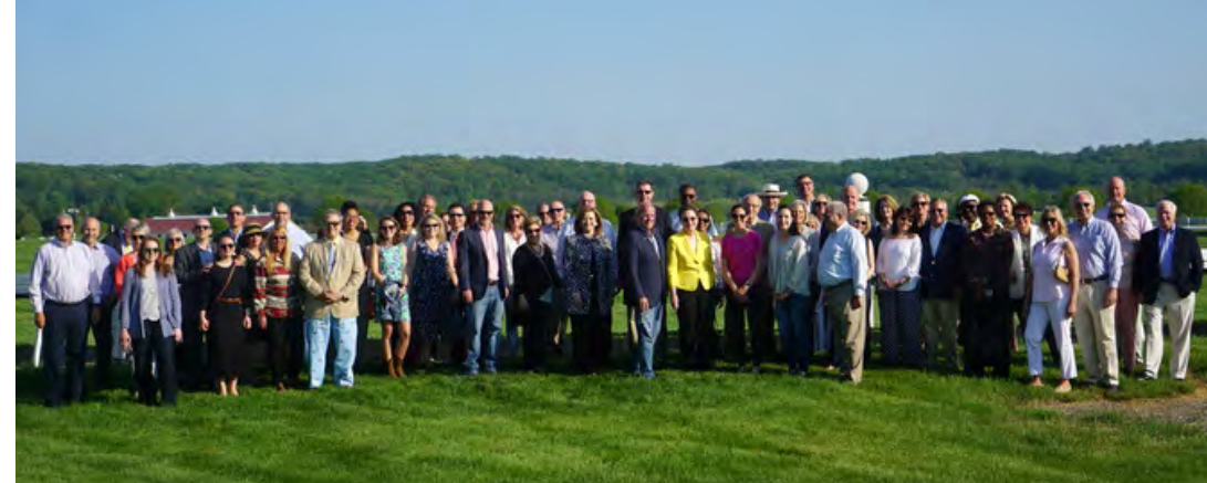
A beautiful evening at Sagamore Farm.