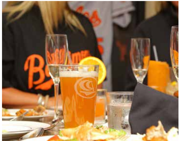
The Orioles Pub will be open for Friday & Saturday home games on May 11, May 12 and June 1.

The Pub will be open for lunch Monday through Friday now until Friday, June 8 and during the Orioles home games on May 11, May 12 and June 1. Don't miss out on seeing new memorabilia from the victorious 1983 World Series!