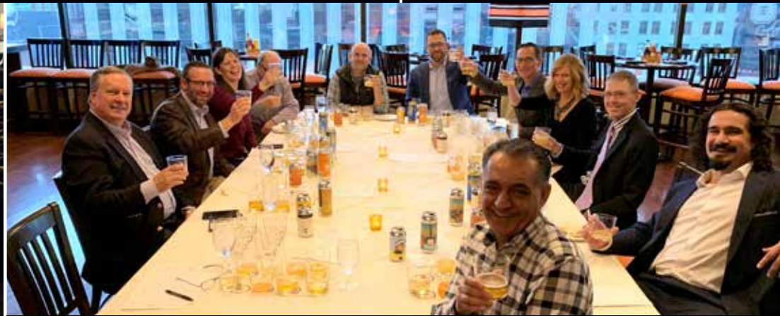
The Craft Beer Club at the Summer Selections Craft Beer Tasting