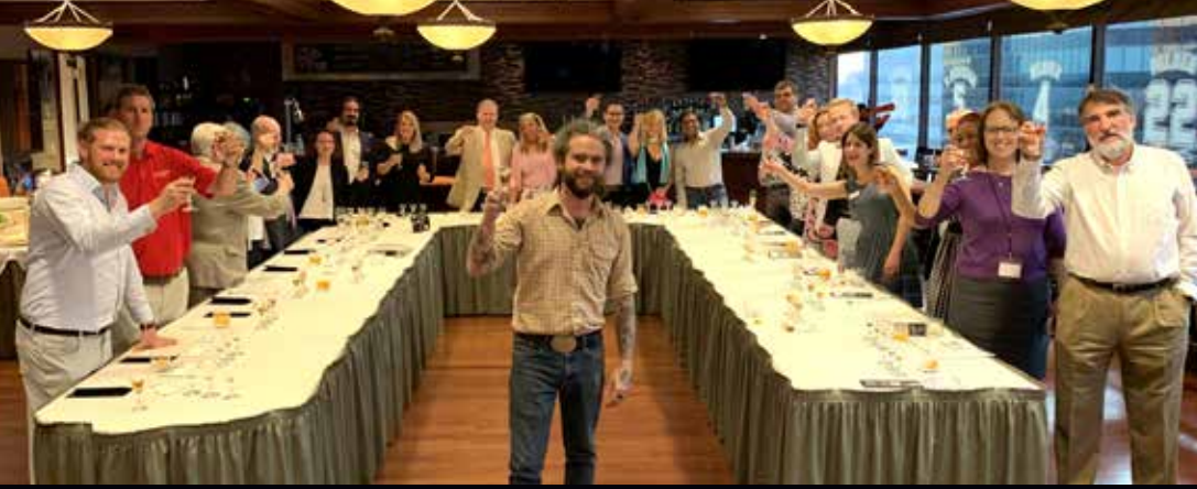
The Cocktail Club and Baltimore Spirits Company Brand Representative at Mixology 101