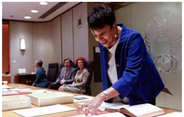
Librarian of Congress Carla Hayden viewing items from the Library of Congress Alexander Hamilton collection